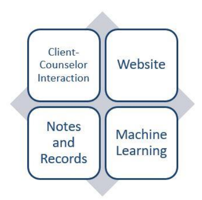
Figure 1. Four foundation aspects of interaction monitoring model

We see that the advantages of online counseling shine here. All interactions between client and counselor are completely recorded in digital form, whether in the form of text, audio, and video. This online counseling interaction data can help the machine to learn. Hence, the student's or client's problem-solving approach can be done based on evidence and is more quantitative than just qualitative estimates. There are four foundation aspects of interaction monitoring model of logo counseling website, as seen in Figure 1. They are client-counselor interaction, logo counseling website, session notes and records, and machine learning techniques.