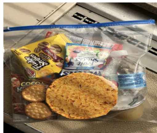
(Figure 2: Food bag)

Figure 1 is a sample book summary one of the elementary students came up with after the pre-service teachers' reading of Maddi's Fridge . The summary showed that the elementary student had a good understanding of the book. In addition, through the pre-service teachers' guidance, the elementary students learned to put their knowledge of the book into action by putting together food bags as shown in Figure 2. This example demonstrated that the pre-service teachers and their students did not only understand critical literacy, but also put it into practice by making a positive impact on the community around them.