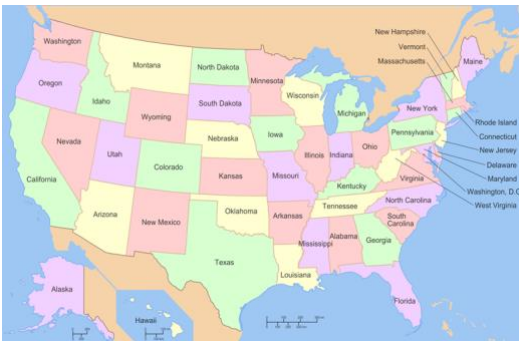
Figure 1. Map of the United States.

Students are better able to recall text when they have music to supplement instruction (Salcedo, 2010). Melodic text is the easiest to remember. In contrast, spoken text, which is often repeated and simple, is the least frequently recalled (Salcedo, 2010). With melodic text, students store the lexical patterns of songs in their long-term musical memory (Fonseca Mora, 2000). As a result, students remember what a song is communicating and recall the information later (Fonseca Mora, 2000). Examples of songs that can help students recall information are the quadratic formula song for mathematics and “Fifty Nifty” which is a song about the states that make up the United States of America. Not only are students remembering the specific language structures that are used in the song and how to produce them, but also the content and information in the song lyrics (e.g. the names of the states in alphabetical order).