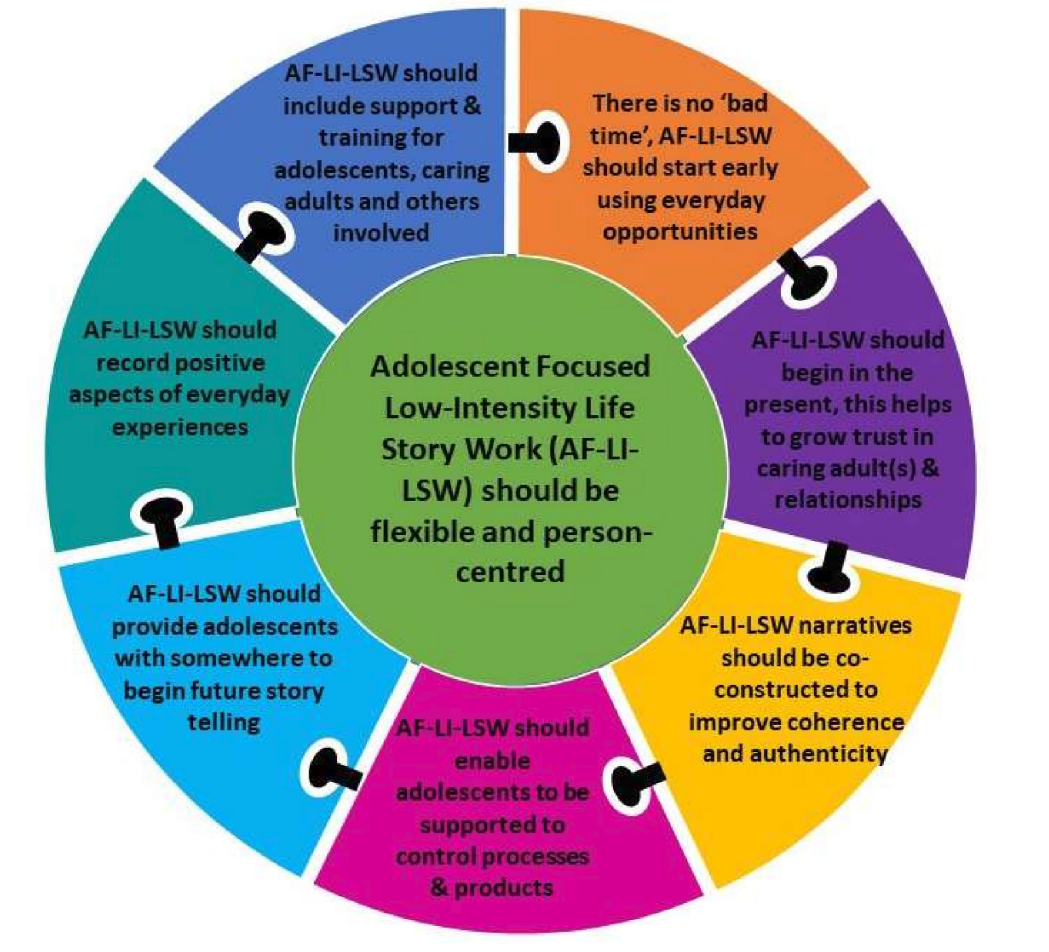
Figure 3 Consolidated programme theory for Adolescent-Focused Low-Intensity Life Story Work.

importance of Adolescent-Focused LI-LSW being flexible and person-centred. Adapting to the needs, interests and wishes of the adolescent is the key initial guideline that underpins all that follow.