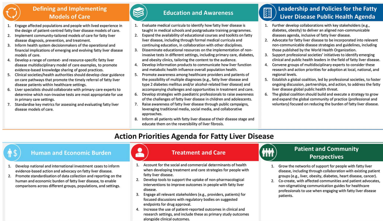
FIGURE 2 Action priorities to turn the tide on fatty liver disease.

the importance of action but the health and economic benefits of this.