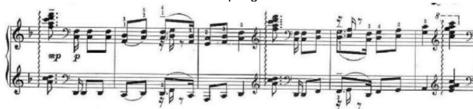
Figure 3 - The evolution of creative thinking on the harmonic elements in "The Moon in Two Springs"

the monophonic thinking of traditional music, giving full play to the advantages of polyphonic weaving in piano music, using polyphonic thinking, equipping monophonic melodies with harmonies or using polyphony; making use of the piano's wide range and distinct intensity levels, so that the melody can have different acoustic effects when presented in each range; using ornamentation, dissonance and subtle changes in pitch intensity to give The use of ornamentation, dissonance, and subtle variations in pitch strength give the piano music a sense of ethnicity and embellishment.