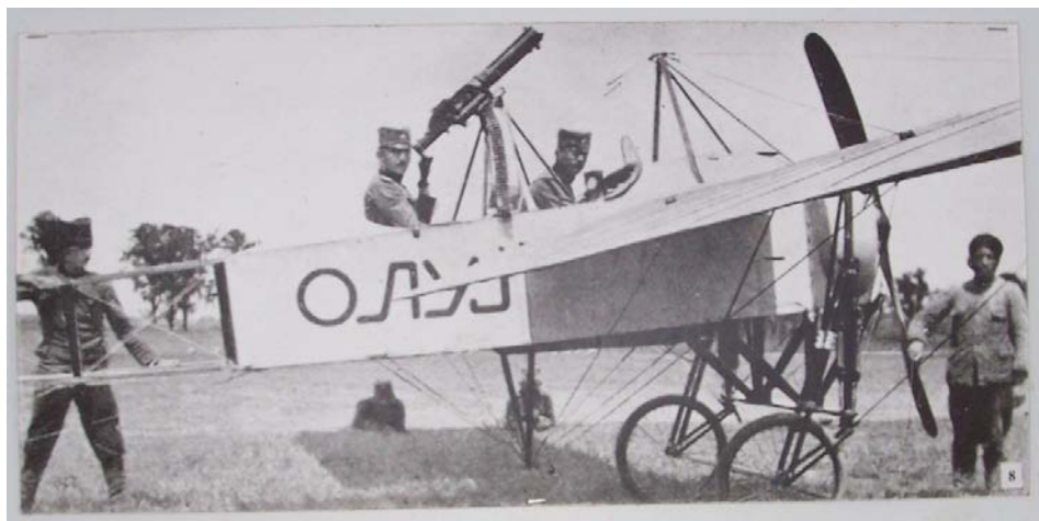
Figure 2 – The first Serbian armed airplane „Oluj“ (Storm) 1915