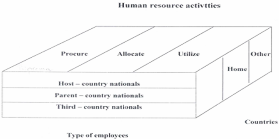
Figure 1 – Morgan's model of international human resource management

3. Three types of employee treatment - employees who are citizens of the host country, employees who are citizens of the home country and the employees who are citizens of some third country or countries. 9