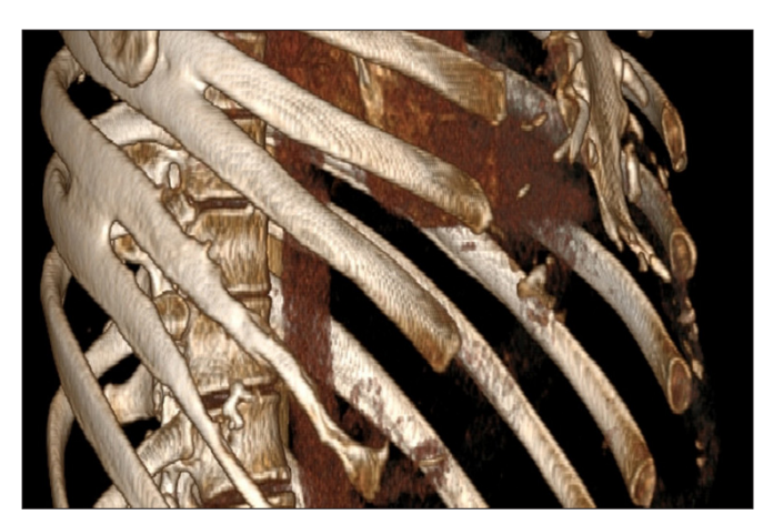
Fig. 4. Thoracic CT scan with bone reconstruction demonstrating costal lysis of the right 8<sup>th</sup> and 9<sup>th</sup> ribs.