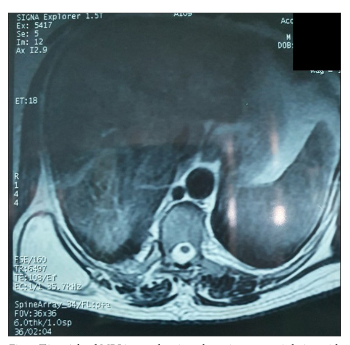
Fig. 5. T2-weighted MRI image showing a hyperintense cystic lesion with a hypointense rim located within the right 7^{th} rib.

progressive, with numerous microvesicles and without encystment of the parasite. ^{[1]}