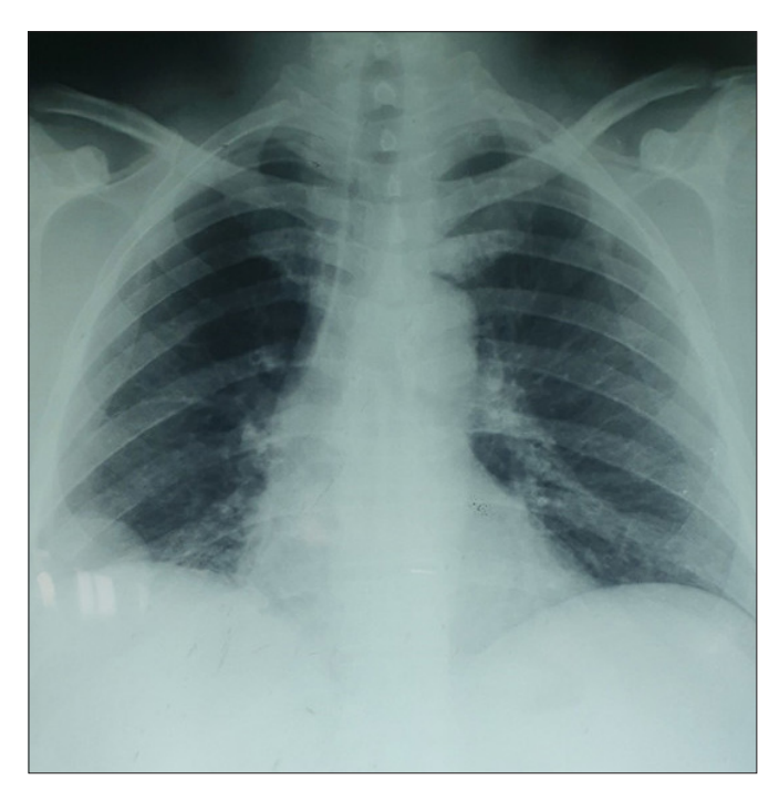
Fig. 2. Chest X-ray showing well-limited basithoracic parietal opacity.

We used a scolicidal agent ( {\rm H_2O_2} ) to prevent parasite dissemination. Pathological examination confirmed the diagnosis by visualising the hydatid membrane and clarifying its multivesicular character. After 24 hours post-surgery, and for 6 months, medical treatment with albendazole was provided for all the patients. The follow-up for all patients was uneventful and no recurrence was noted.