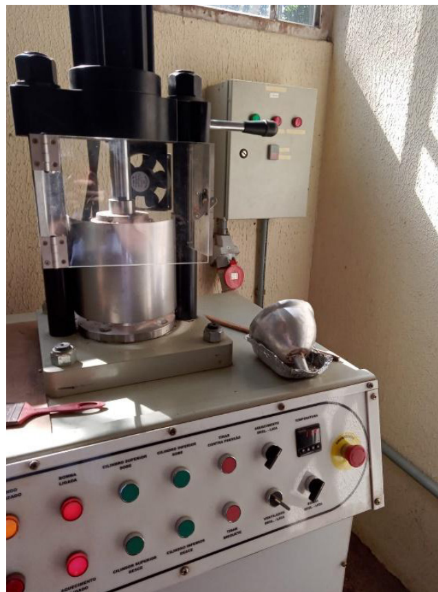
Figure 1: Laboratory Briquetting Machine.

According to figure 1, the provided description pertains to a laboratory-scale briquetting machine. This apparatus is employed for the compaction of biomass materials into briquettes. The machine features a compact design and is equipped with mechanisms for applying pressure and temperature control during the briquette formation process.