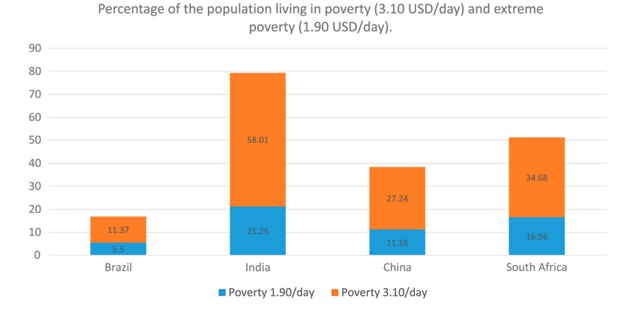
Figure 1. Percentage of the population living in poverty (3.10 USD/day) and extreme poverty (1.90 USD/day). All data are from 2011 except for China (2010).

Policy initiatives are important for reducing poverty and (less often) inequality (Barrientos, 2011). India's MGNREGA, for example, is credited with an overall poverty reduction of 32 per cent and for preventing 14 million