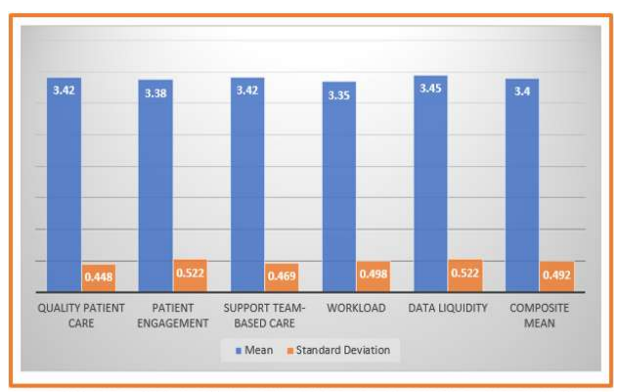
Legend: 3.50 – 4.00 = Highly Effective; 2.50 – 3.49 = Moderately Effective; 1.50 – 2.49 = Fairly Effective; 1.00 – 1.49 = Not Effective Figure 2: Summary of EHRs Effectiveness to Health Care Outcomes

Lastly, with data liquidity, EHRs were overall indicated as moderately effective (3.16\pm0.772) in terms of enhancing access and retrieval of data (3.20\pm0.880) , providing central system and storage of data (3.18\pm0.882) , facilitating regulatory compliance (3.17\pm0.871) , ensuring privacy and security of data (3.14\pm0.892) , and allowing data analyses and comparing trends of data for research purposes (3.13\pm0.880) .