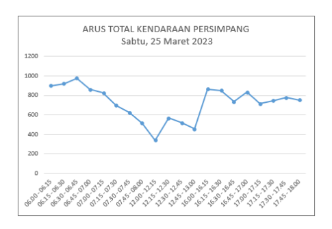
Gambar 4.1 Grafik arus total kendaraan per simpang hari Sabtu, 25 Februari 2023

Table 4.1 shows the total flow of vehicles on Saturday, 25 February 2023. The following is a graph of the total flow of vehicles per intersection on Saturday, 25 February 2023