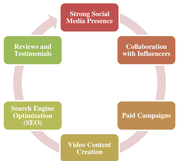
Figure 3. Digital Marketing Strategy for Bira Beach by the Bulukumba Government

share amazing images from Bira Beach, including sunset moments, snorkeling activities and various other attractions. These posts not only show the beauty of nature, but also the positive interactions of visitors with the local community. Recognizing the power of digital influence, the government has collaborated with several travel influencers and bloggers to visit and promote Bira Beach. Reviews and stories from their experiences often provide a fresh perspective and appeal to a wider audience. Through advertising on Google Ads and paid promotions on social media, Bulukumba targets specific audiences who have a high interest in beach tourism or diving. This allows them to reach the right demographic with tailored messages.