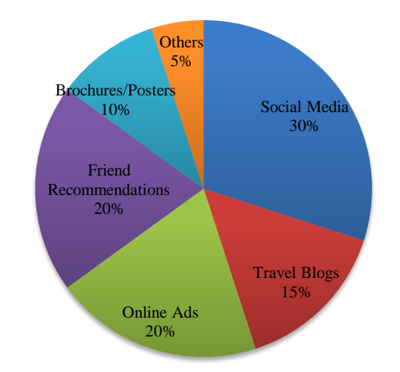
Figure 2. Source of information for Bira Beach tourists

Digital Marketing Strategy to Increase the Number of Tourists at Bira Beach Digital marketing is a way to carry out comprehensive promotions for activities carried out by Bira beach managers. The digital marketing strategy increases the number of tourists using many methods including digital promotions, online media as well as print and electronic media, apart from that, to further improve communication outside involving several communities and the public including friends and business actors who play a big role in promoting Bulukumba tourism. Of the 250 respondents who visited Bira Beach in the last year, 65% said that they learned about Bira Beach through digital platforms, such as social media, travel blogs or online advertisements (see figure 2).