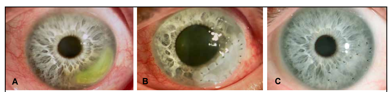
Fig. 1. Patient L. Autoimmune peripheral corneal ulcer (A). Day 5 after amniotic membrane transplantation (B). Month 3 after amniotic membrane transplantation (C).