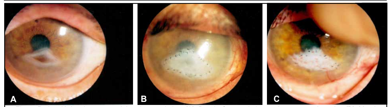
Fig. 5. Patient K. Autoimmune peripheral corneal ulcer (A). Day 8 after amniotic membrane transplantation (B). Month 3 after amniotic membrane transplantation (C).