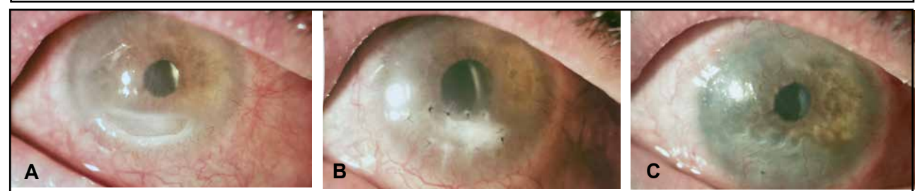
Fig. 2. Patient M. Neurotrophic peripheral corneal ulcer (A). Day 11 after amniotic membrane transplantation (B). Month 4 after amniotic membrane transplantation (C).