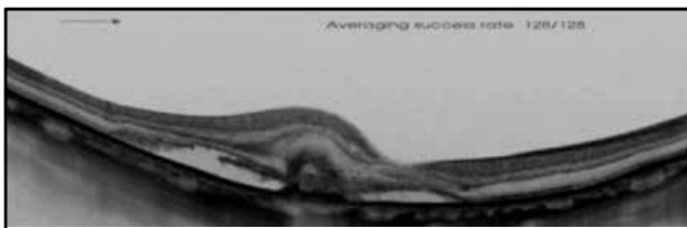
Fig. 1A. The baseline OCT scan shows a neuroepithelial detachment with subretinal and intraretinal fluid, retinal pigment epithelium (RPE) detachment with a hyperechoic focus, and subretinal hyperreflective exudation beneath the RPE, before anti-VEGF treatment