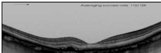
Fig. 1B. The OCT scan shows complete subretinal fluid resorption, adherence of the neurosensory retina and retinal pigment epithelium (RPE) detachment with a hyperechoic focus after anti-VEGF treatment