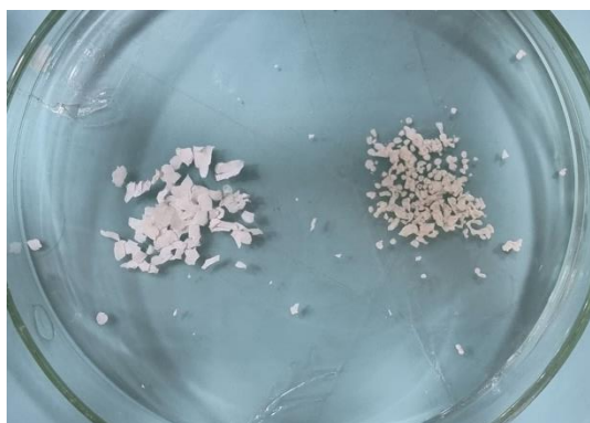
Figure (3): Visual PRD-bead shape, Beads A at the left side and Beads B at the right side of the picture.

The improvement in shape, size of Beads B resulted in uniform tablets with smooth surface compare to tablets prepared from Beads A as shown from Figure ( 4 a- & b).