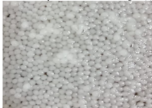
Figure (1): Photograph of PRD- Alginate Beads before Drying.

The wet beads productions (before drying) were uniform in shape and size as shown in Figure (1).