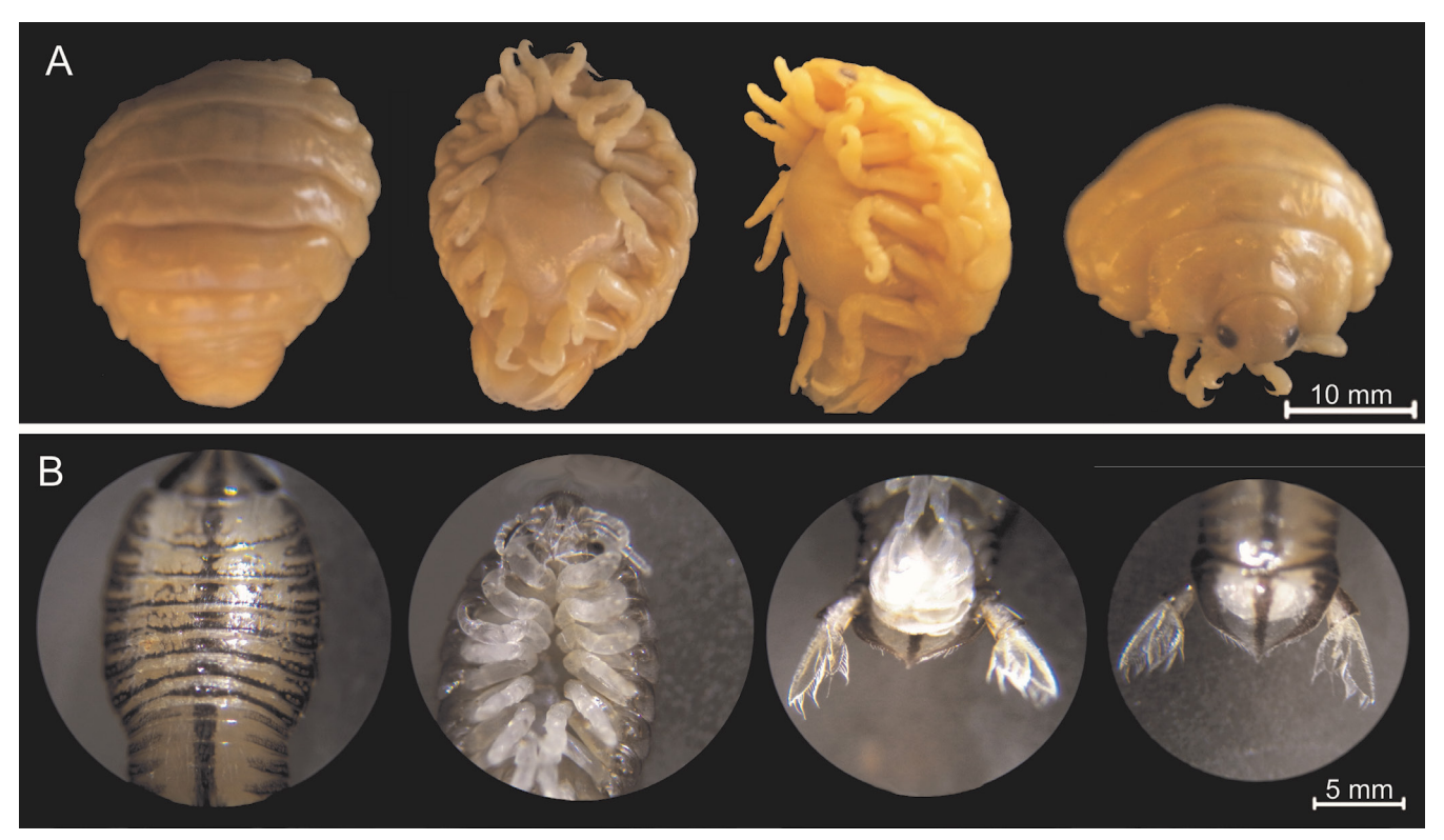
Figure 2. Riggia cryptocularis (Crustacea: Cymothoidae) individuals captured fishes of the Doce river. (A) Female species in diverse views. (B) Male species in diverse views.

Barred environments change aquatic habitats and the natural relationship between fish fauna and their parasites, which makes an aquatic community favorable for parasitic outbreaks (Morley 2007; Smit et al. 2014). Furthermore, inadequate exploitation of fishery resources and species introduction in hydropower projects disrupt the ecosystem by inducing homogenization of biotic components, extinction of native species, and parasitic outbreaks (Vitule et al. 2012; Lacerda et al. 2013; Pulkkinen et al. 2013; Hulme 2014).