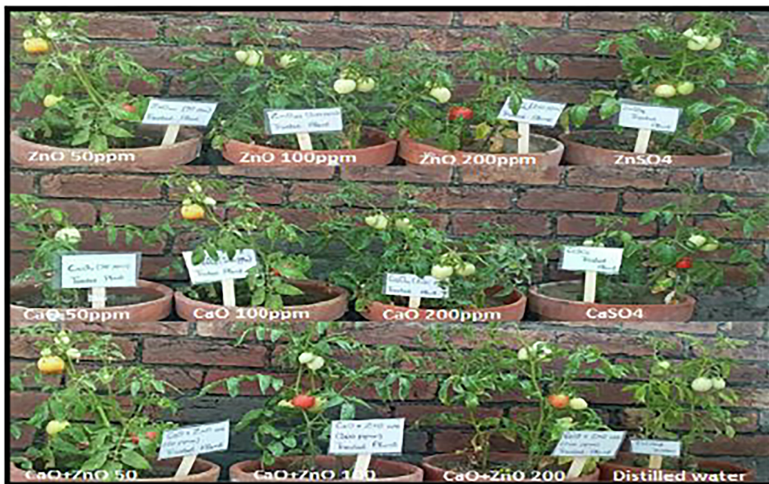
Fig. 2. The pictorial description of the effect of various applied treatments of nano-sprays on growth and yield parameters of S. lycopersicum .

tomato plants enhanced shoot length, root length, no. of shoots, no. of roots, leaf area, fresh plant weight, number of fruits per plant, fruit diameter, and weight of tomatoes per plant by 10.4, 84.7, 11.1, 27.7, 22.4, 5.3, 66, 29, and 100% respectively as compared to combined treatment of conventional zinc salt and calcium salt spray to tomato plants.