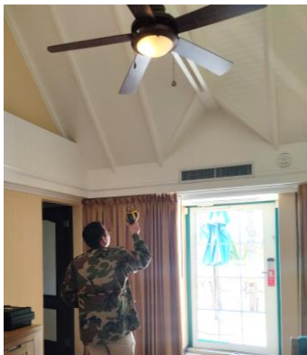
Figure 1: Student collecting data with a thermal camera during field work.