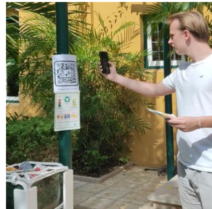
Figure 4: Screenshot from the video tutorial.