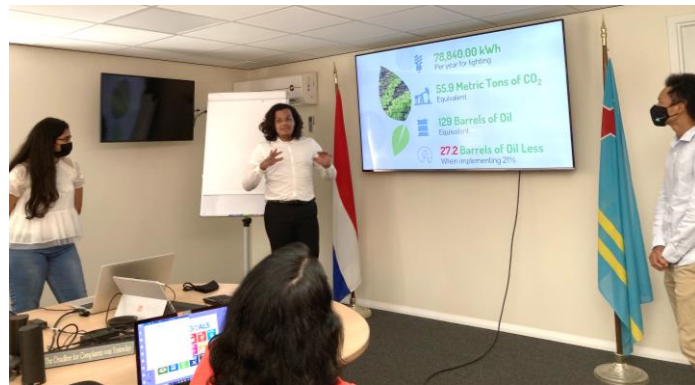
Figure 2: Students presenting the results and sustainability recommendation to the "client".