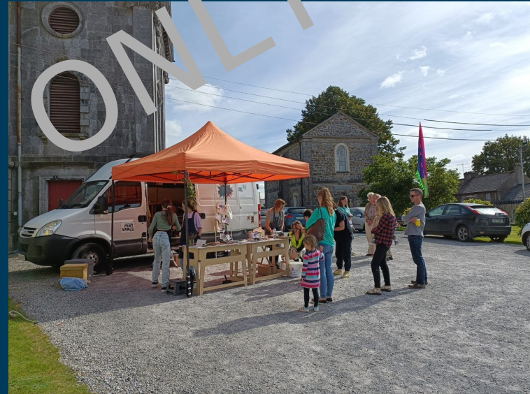
Fig 1-2. Cashel Arts Festival in Tipperary, 2022.