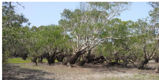
FIGURE 1 Melaleuca cajuputi (GELAM)

Melaleuca cajuputi (Figure 1) leaves were gathered from the heath forests in Kampung Jambu Bongkok, Marang, Terengganu in Malaysia. Kampung Jambu Bongkok is situated on Peninsular Malaysia's East Coast; Kuala Lumpur is about 388 km from this place (Figure 1). The leaves were cleaned and freeze-dried before they were ground to a fine powder that was preserved at -20^{\circ}\text{C} for evaluation.