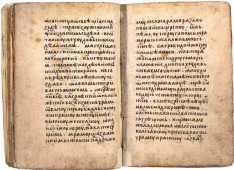
Hagiography of Holy King Stefan Dečanski by Grigorije Camblak in the Manuscript No 99, about 1430–40: Description of the Dečani Monastery

subsequent Neoplatonic schools. The antepredicaments are followed by Aristotle's ten categories: suštstvo ( ousia ), količstvo ( poson ), кb časomu ( pros ti ), kačstvo ( poion ), gde ( pou ), kogda ( pote ), ležati ( keisthai ), imeti ( ehein ), tvoriti ( poiein ), stradati ( pashein ). The concluding part of John of Damascus' text deals with postpredicaments, i.e. the different forms of opposition (contradiction, contrariety), types of statements (negation, affirmation) and syllogism. Apart from logical concepts, the Dialectic also explains philosophical and theological concepts such as hypostasis (Slav. sbstav ), person ( lice ), etc. It is obvious that the purpose of this work was to introduce the reader to logic and basic philosophical concepts, without which it was impossible to proceed to more advanced philosophical and theological topics.