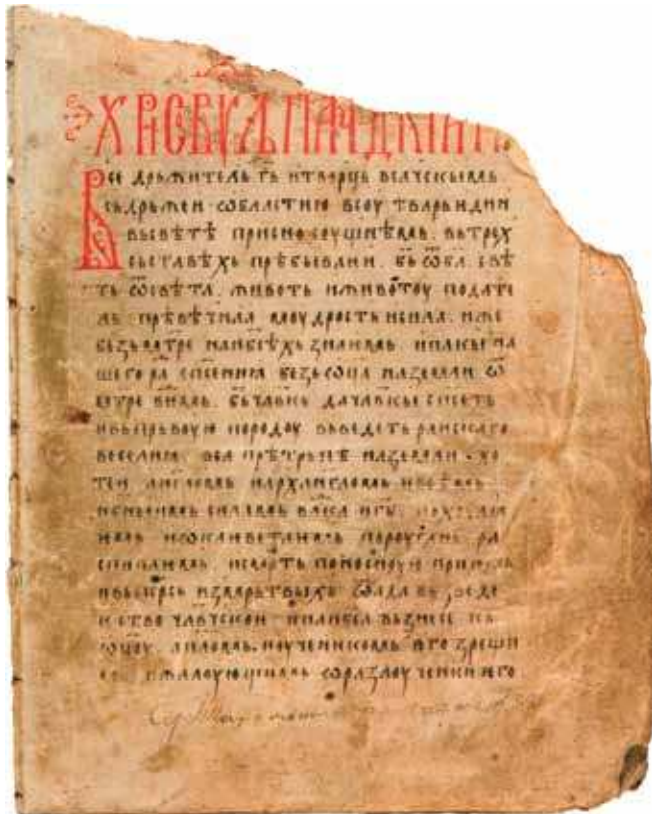
Opening lines of the third Charter of the Dečani Monastery, 1343–45, archive of the Serbian Academy of Sciences and Arts

What is known, however, is that highest education was acquired mostly in Byzantium or under private tuition provided by foreign teachers, whilst further educational opportunities were provided by monastic centres such as Mount Athos, and there notably the Serbian monastery of Hilandar 8 with its renowned translation school. Thus, there were in the centres of medieval Serbia sophisticated writers and connoisseurs of many languages trained in the liberal arts (i.e. grammar, rhetoric, dialectic, astronomy, geometry, arithmetic and music), as well as scribes, who, just like those in Byzantium, were trained for secular and ecclesiastical administrative duties as well as for commerce.