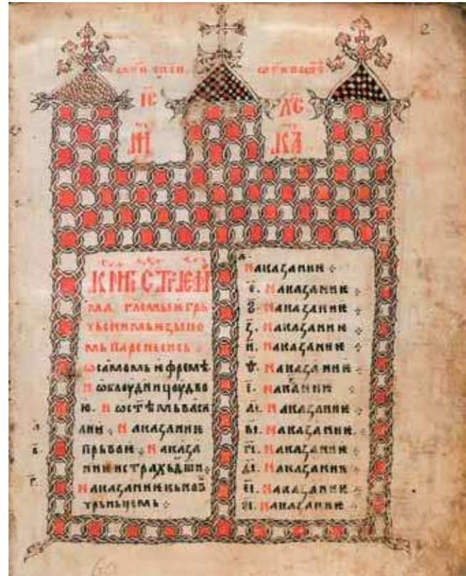
A Miniature in the Paraenesis of Ephrem the Syrian, 1337

quently growing difference from the Serbian, Russian and Bulgarian vernaculars. 50 Apart from the literary language into which philosophical texts were translated, the vernacular was used in writing as well, mostly for laws and royal charters, and there was also a vernacular written literature (chivalrous romance) and history (chronicles).