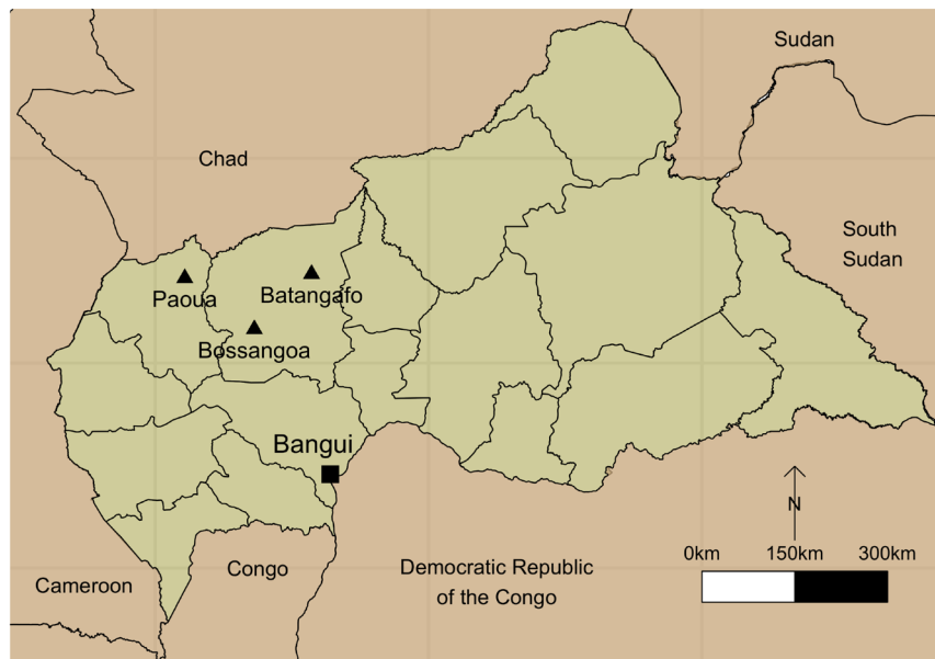
Figure 1. Map showing the location of the three reporting hospitals in the Central African Republic: Bossangoa, Batangafo and Paoua in relation to one another and to the capital Bangui. The country is shown divided by prefecture (highest administrative level), Bossangoa and Batangafo are located in Ouham prefecture and Paoua is located in Ouham-Pendé prefecture.

Data were collected prospectively from three reporting hospitals (shown in Figure 1) from December 2015 to May 2017 as part of routine communicable disease surveillance. Our confirmed case criteria and clinical management of patients followed the guidelines from the World Health Organization 6 . Our analysis included all confirmed cases with bacterial meningitis in the three hospitals over the observed periods. Data on suspected and negative cases were collected in Paoua using established definitions 5 . Patient outcomes were recorded in Bossangoa and Batangafo along with socio-demographic characteristics (age, sex, residence) in all regions. Patient outcomes and incidence rates have previously been reported from Paoua Hospital over a subset of our observation period 7 .