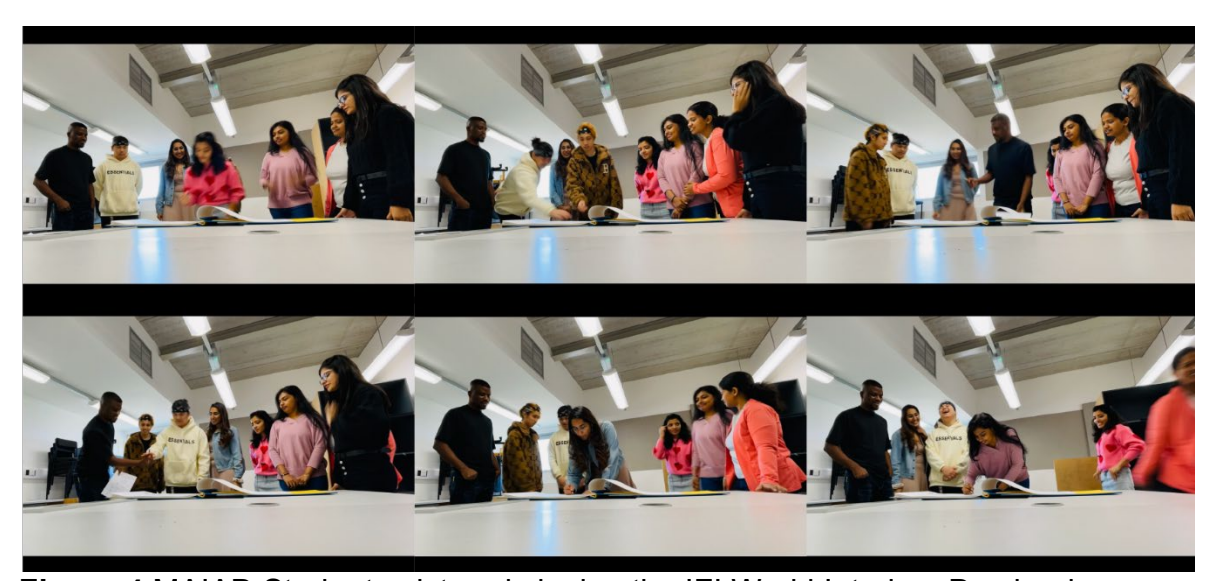
Figure 4 MAIAD Students pictured signing the IFI World Interiors Day book