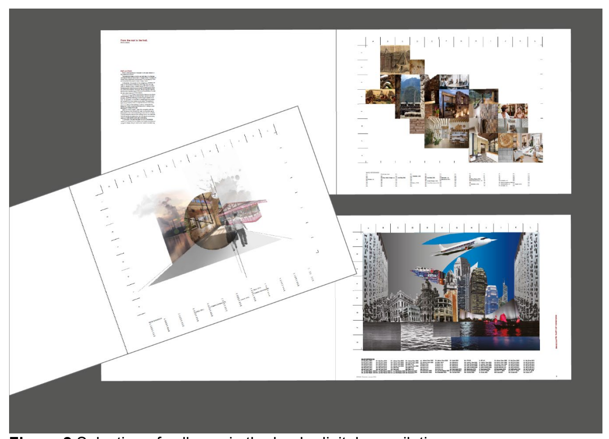
Figure 2 Selection of collages in the book: digital compilation

These were submitted digitally to allow the academic team to curate and collate the book.