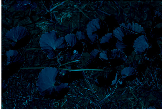
Figure 2 Centella asiatica compound health tea ingredients