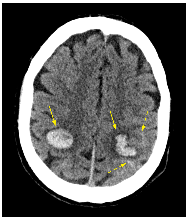
Figure 1. Axial non-contrast CT. Image demonstrating bilateral parenchymal haemorrhages (solid arrows) with a small amount of subarachnoid haemorrhage on the left (dashed arrows)