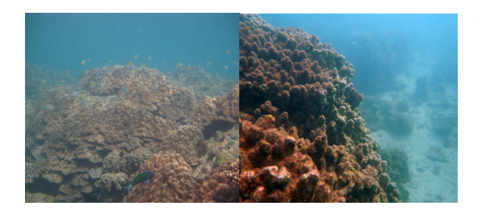
Fig. 1. Coral Reefs of the Persian Gulf (Qeshm Island) after a Temperature Rise in Summer, Left: 2015, Right: 2017.

symbionts and hosts under environmental stress (9).