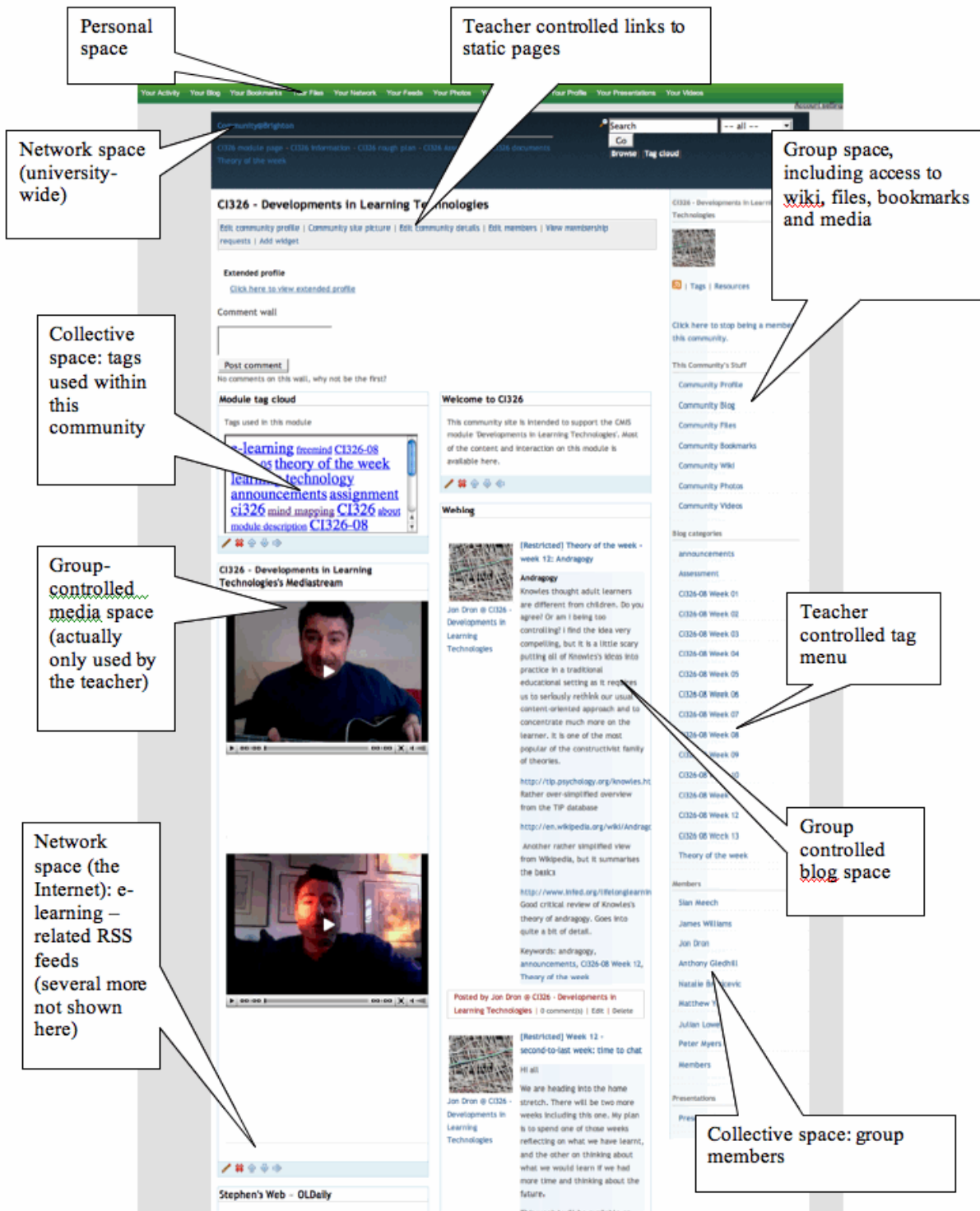
Figure 2: the entry point to the CI326 community, showing overlapping spaces