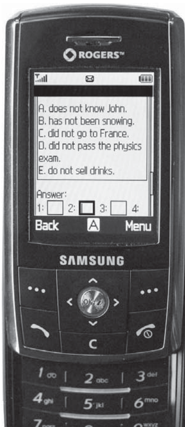
FIGURE 3. Mobile ESL display on a basic cellphone

choice, short-answer, jumbled-sentence, matching/ordering and fill-in-the-blank exercises on the World Wide Web. The content is specifically formatted for output on small mobile devices. Figure 3 illustrates the mobile ESL content on a basic cellphone. This familiar learning context lends a sense of security to teachers and learners when using the mobile devices for learning. It adheres to the principle of introducing new technologies in a familiar context, as one would introduce new pedagogical approaches in traditional contexts. The course site has been developed to also auto-detect for desktop display; PDF and Microsoft® Word documents are provided for download or printout, should the learner prefer to use these document formats.