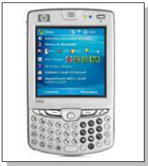
Figure 1. The HP iPAQ 6955

It was not a simple task for our participants to learn to use all the features available on these devices. As reported above, the PDAs provided to the participants were loaded with a relatively wide range of software. The HP iPAQs also provide users with a number of built-in features, including both a touch screen (with stylus) and a thumbing keyboard (See Figure 1) and the capability to transcribe hand writing using the stylus to text. In addition, when appropriate service is available, iPAQ 6955 users can use either WiFi hotspots or GPRS (cell phone and data) wireless connectivity to send email, browse the Internet or use an audio conferencing program such as Pocket MSN Messenger or Skype. Participants were provided with both types of connectivity. For the study, the iPAQs were set up with local service GPRS connectivity and WiFi was available both on campus and in spots around the community (e.g., coffee shops) as well as the home networks of some participants.