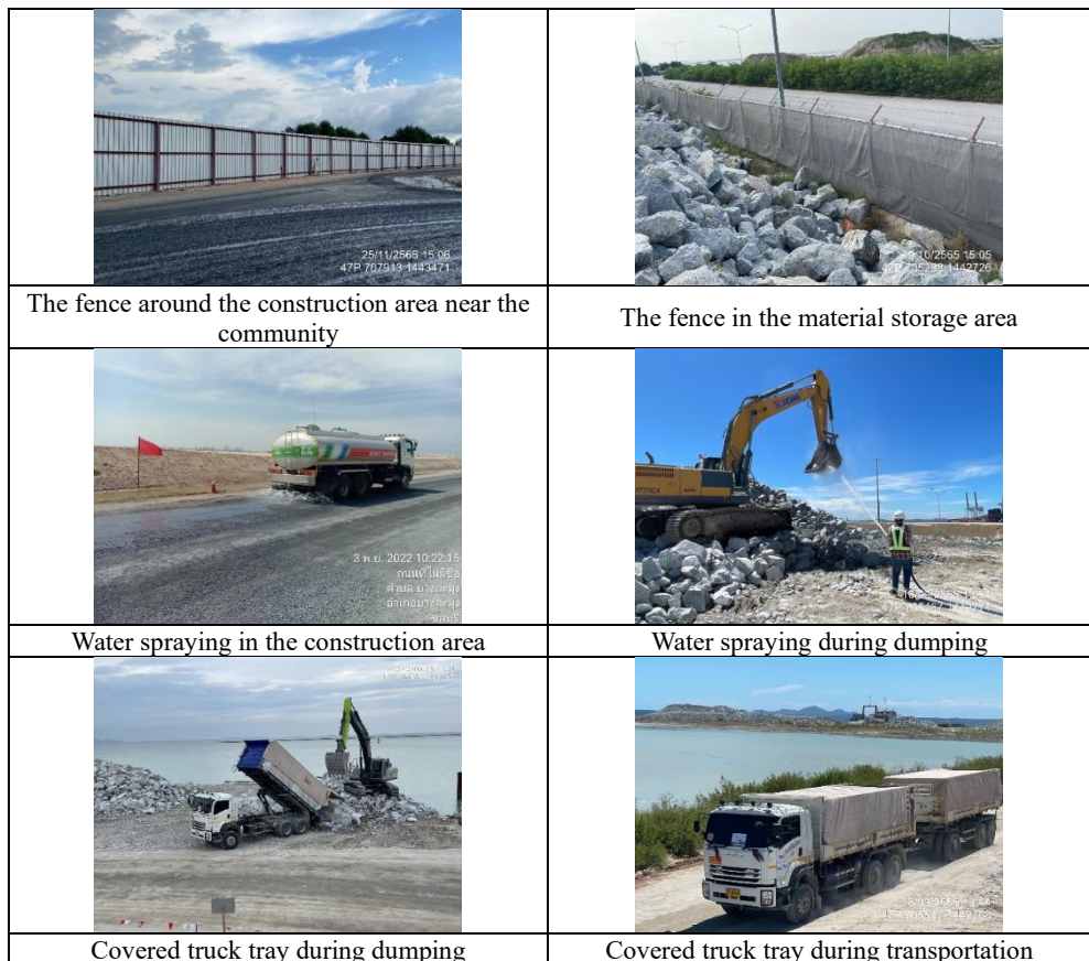
Table 1. Selected photos of land-based environmental mitigation measures being complied