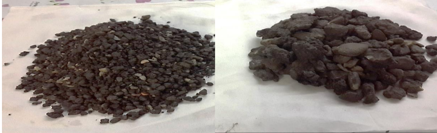
Figure 2: Fractionated samples (coarse and fine) of the Reclaimed Asphalt Pavement (RAP).

being used to create asphalt mixtures, RAP sieve analysis was carried out and divided on a No. 4 sieve, as indicated in Figure 2.