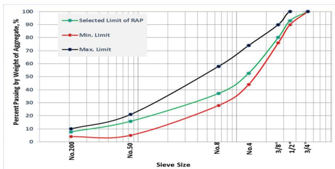
Figure 1: Reclaimed Asphalt Pavement (RAP) material gradation.

RAP used in all mixes in this research was from Baghdad Governorate in the Republic of Iraq and tested to calculate the asphalt content in the asphalt mixture by ASTM D6307-10 [20] "Asphalt content by ignition. Furnace" It demonstrates that the average amount of asphalt in RAP was 4.6%. The aggregate gradient in RAP is distributed, as shown in Figure 1.