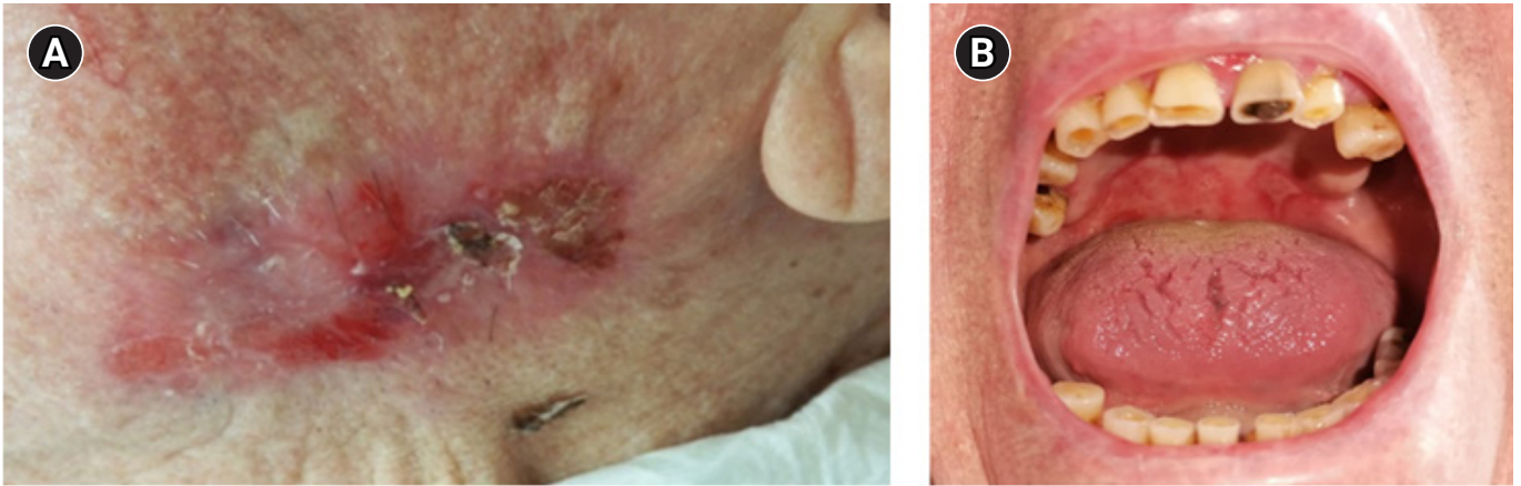
Fig. 1. Clinical presentation: (A) atrophic plaque on the left cheek, with a post-blister erosion in the center associated with painful erosion located on the palate (B).