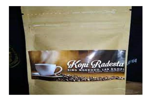
Figure 2. Left: Bubuh Sambal Cak-Cak, Right: Kopi Redesta on sealed package

Internal factors supporting gastronomic tourism in Tista include prioritizing unique culinary culture and history, existing tourist attractions with facilities and infrastructure, and a positive village image from national and regional wins. Weaknesses encompass limited cooking tools, language barriers, and disorganized food processing.