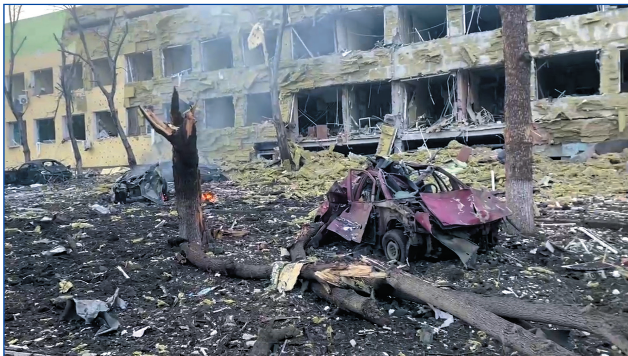
Figure 1. A children's hospital in Mariupol was destroyed as a result of a Russian airstrike ( www.pravda.com.ua/news/2022.03.9.7329805 )

Eighty-six attacks on medical workers were recorded, resulting in the deaths of at least 106 medics, 33 of whom died on the job, and 52 injured [8]. It must be said that in the frontline regions, an extremely difficult situation has developed with regard to the provision with medical personnel, which, together with the above-mentioned factors, definitely affects the availability and quality of medical care for children and adults. At present, the situation in the frontline regions has definitely worsened due to the transfer of medical staff to other regions of Ukraine and their emigration. This