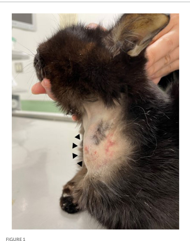
Gross appearance of a subcutaneous abscess (arrowheads) on the left neck.

On day 1, the subcutaneous mass was incised using a scalpel blade and the pus was excreted. Cytological examination of the pus revealed hyphae with neutrophil and macrophage infiltration (Figure 2). Thus, the mass was diagnosed as an abscess. The bacterial culture of the pus was negative. On day 3, local treatment with an incision of the subcutaneous abscess and washing with saline and systemic administration of itraconazole (Itrizole capsules; Janssen Pharmaceutical K.K., Tokyo, Japan, 10 mg/kg, PO, q24h) were initiated. However, the owner observed anorexia and lethargy soon after treatment initiation. Although the plasma total bilirubin (TBIL) level was 0.7 mg/dL (reference interval [RI]: 0.1–0.5 mg/dL) 23 days prior to treatment, it was elevated three days after initiation (1.8 mg/ dL). Because these abnormalities were considered to be induced by the adverse effects of itraconazole, the drug was discontinued on day 5. Subsequently, local treatment with incision, washing, and infusion