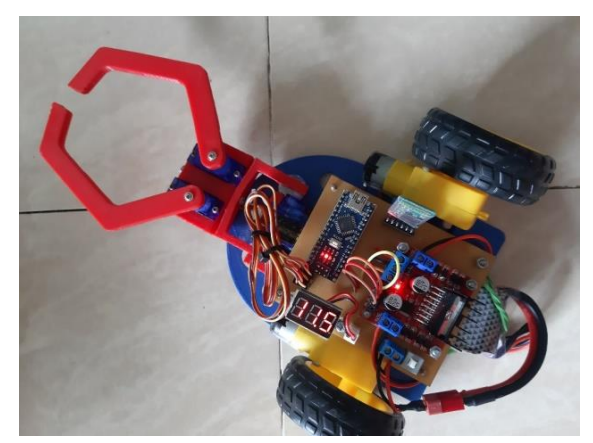
Figure 3. The Robot Transporter