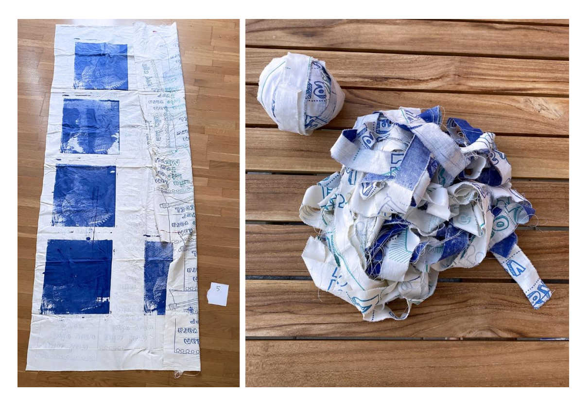
FIGURES 5 AND 6. All waste textiles were numbered and documented in photos before the work with the rug started. After documentation, the textiles were heat transferred to obtain good washing durability. The fabric was then torn into 2.5 cm wide strips. This is dusty work and it is thus preferable to do it outdoors.