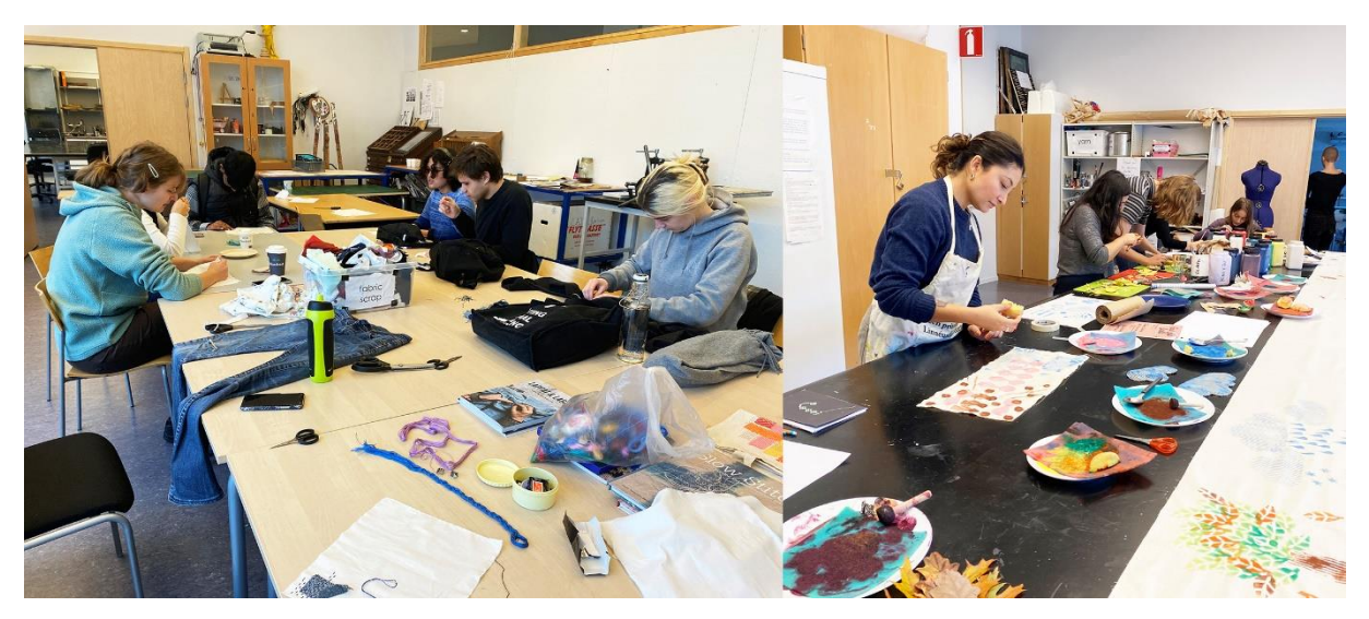
FIGURES 3 AND 4. Textile-making group doing visible mending and collective textile printing. We also explored no-waste sewing, natural dying, pattern design and cyanotype printing as well as upcycling of second-hand clothes. We learned a lot, but the social aspect of interacting while making was also important. The work was fun and very satisfying but also a bit frustrating; many students wanted to join, but only a few had the time.

learn. It was voluntary for the students to join the group, and all our activities were guided by our curiosity and desire to work as sustainably as possible (Figures 3 and 4).