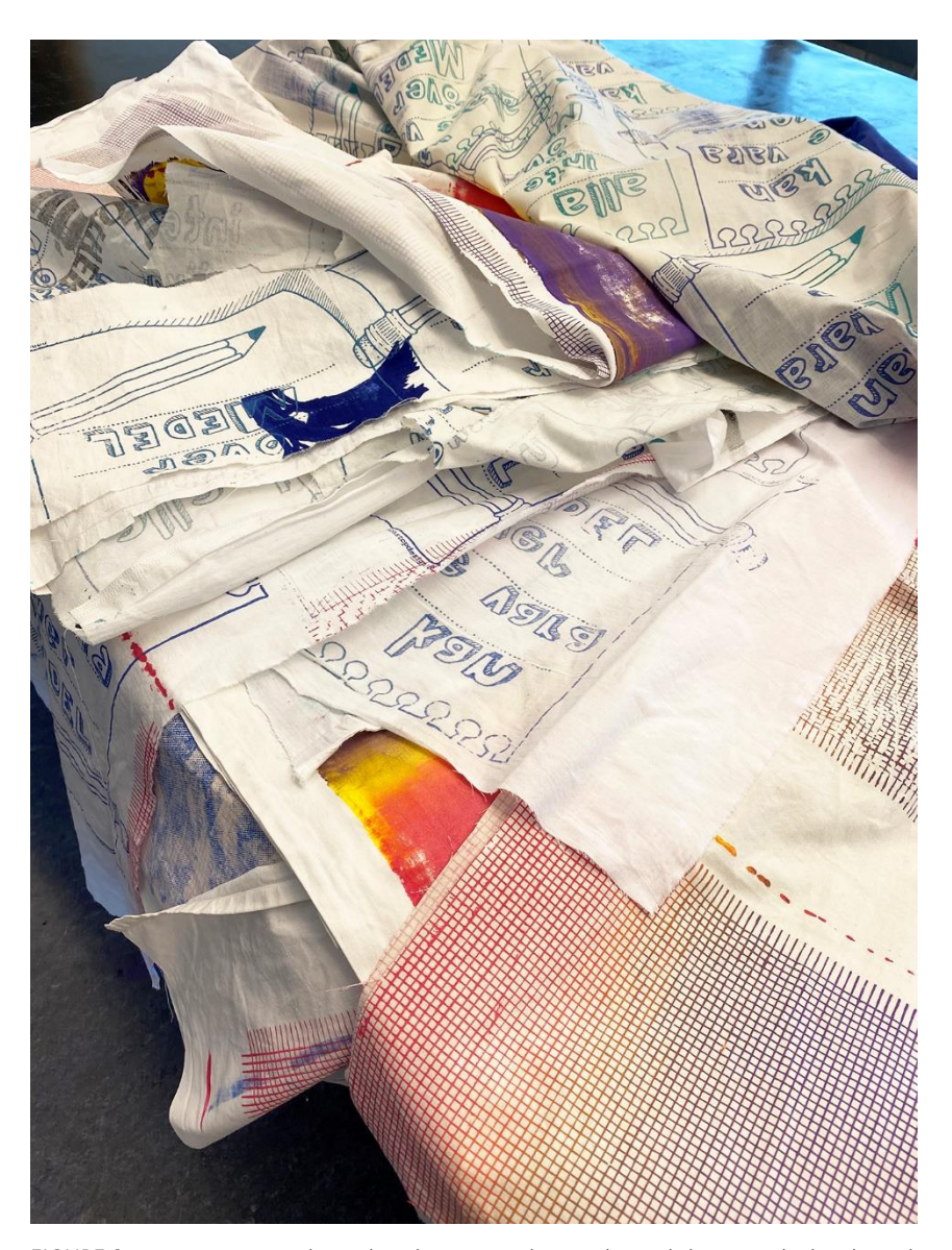
FIGURE 2 . Every year, I conduct a big clean-up in the textile workshop, in which I clean the screen printing frames, scrub the printing table, give the sewing machine some love, and throw away leftover materials. This is just a small part of the textile waste from the clean-up. Apart from test printing fabric, prototypes, mixed printing ink, sketches, prototypes, knitting and embroidery traces were also found.

At the same time as the workshop cleaning, I was trying to learn the 'inbraiding' technique. For me, this was a new craft technique that I found interesting from different perspectives, not the least since it is possible to use waste textiles when making rugs. I saw an opportunity to use the waste from the workshop and make something new out of it (Figure 1). The aim of this paper is to discuss how we can use textile waste as a resource both for new creations and for learning about sustainability. The resulting rug is shown at the conference exhibition.