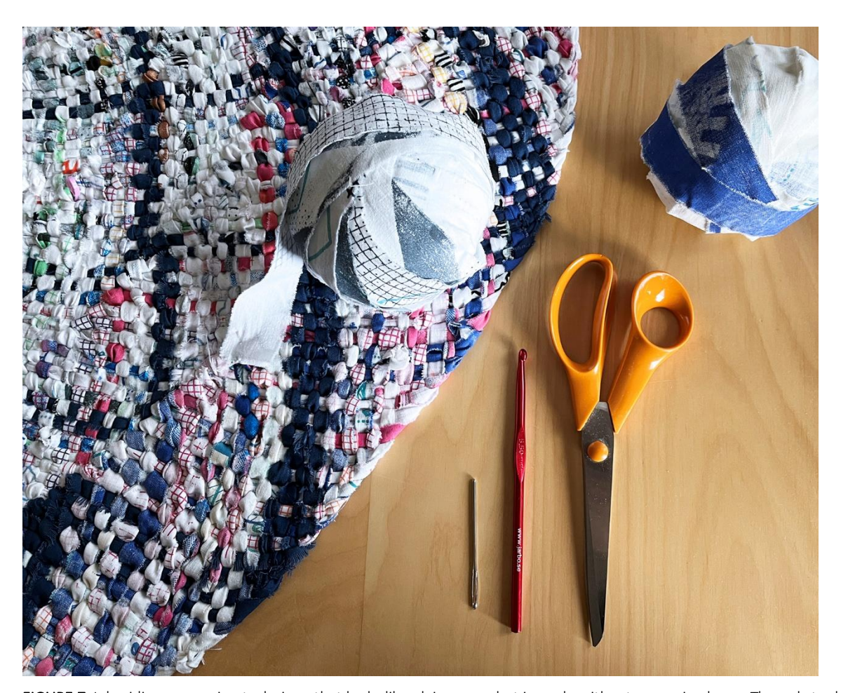
FIGURE 7. Inbraiding rag rug is a technique that looks like plain weave but is made without a weaving loom. The only tools needed are a crochet needle, a pair of scissors and a big needle. The braiding starts from the middle of the rug (or the object) and is done in a spiral shape. The inbraiding is done in the previous row, and there is no need for sewing. The technique is also called 'no-sew rag rug'.