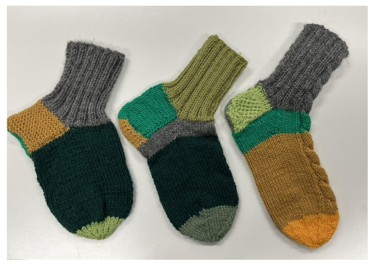
FIGURE 2. Pedagogical socks designed for three different levels of learners. On the left: A sock knitted as flat knitting, suitable for pupils with fine-motoric skills challenges. In the middle: A 'traditional' Dutch-heeled sock. On the right: A sock with cross-flipped square heel and a cable on top. In all socks, different structural parts have been emphasized with different colours.

Indeed, students perceived individual goal setting as a developmental opportunity to establish and evolve capabilities to impact future teaching; for instance, when right-handed students learned to knit left-handed. In the future, teacher competence with left-handed knitting would help them teach left-handed students. As one student noted: