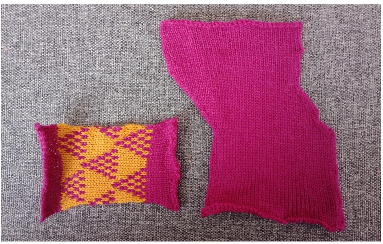
FIGURE 3. Multi-coloured and flat single knit with decrease and cast on exercises with machine.

I have once knitted with a machine, but never with multi-coloured knitwear. Now I'd like to learn that. I also saw a video on that topic elsewhere and became interested in using machine to knit multi-coloured pieces and exploring other possibilities of the machine. (Course 2: 10: a)