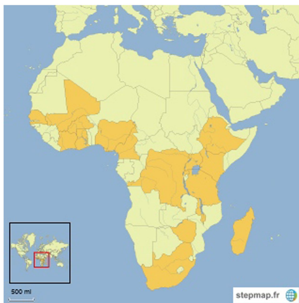
FIGURE 2 Countries represented in included studies.