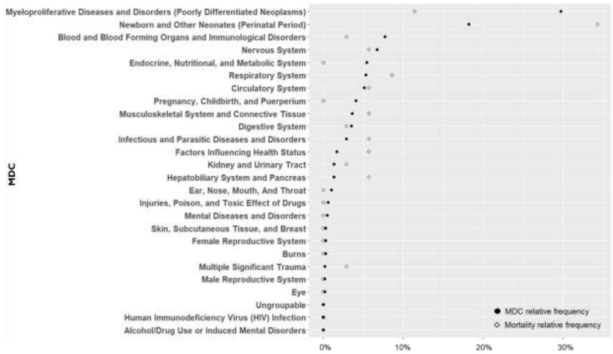
Figure 2. Major diagnosis categories (MDC) relative frequency compared with mortality relative frequency