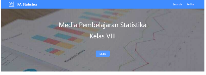
Mengapa App Ini Bagus Untuk Kamu:

The development stage is carried out after the design has been carried out, everything that has been analyzed and designed is converted into a form of source code so that it becomes the planned learning media application. The development process uses HTML, CSS, and Javascript (React and Next.js). The results of the development are products that are made based on the stages of analysis and design. Digital teaching materials, the concept of monitoring student activities, and planned features are contained in interactive learning media. So that they are divided into three sections based on account access, namely the general page (homepage or homepage), subject page, and instruction page. Then for the admin account, namely admin management, class management, and viewing details of student development. As for students, they access materials and quizzes, a dashboard profile, and an evaluation page. Using React and Next.js, this learning media can run offline or without an internet connection as long as the application is loaded perfectly during initial use (when it is first opened in a tab). Thus, users can still study smoothly even though they are constrained by an unstable internet network.