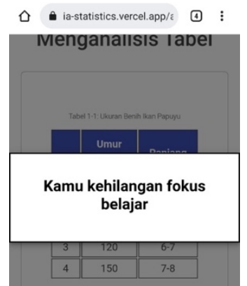
Figure 3. Warning message if students are inactive on display on smartphone

display charts and graphs. React Katex is used to display the mathematical formula notation contained in the material. On the material page there are activities that students must do as defense activities. When the activity has been carried out correctly, the student learning activity progress bar at the bottom of the image will be filled, this progress will be stored locally behind the screen of the user's device and in the cloud in the database. On the material page monitoring of student learning activities is also implemented. If students are not active in using the media, such as not interacting with the mouse and keyboard on the media for more than 2 minutes or opening an application other than the learning media, the system will display a warning message to direct students to focus more on learning. Thus, the application of student activity modeling to this learning media can help them learn independently in a more directed manner (Kabi et al., 2013). This can be seen in Figure 3 below.