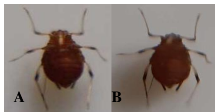
Figure 4. P. nigronervosa tick on rat taro (A) the fourth instar abdomen, (B) the fourth instar dorsal

Biological tests of P. nigronervosa taro mice were carried out in the insectarium room where the temperature could be adjusted to be suitable for the development of P. nigronervosa . Environmental data on P. nigronervosa biological tests on rat taro could be seen in (Table 6).