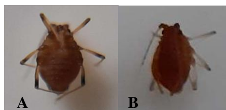
Figure 3. Pentalonia nigronervosa tick on taro mice (A) the third instar abdomen, (B) the third dorsal