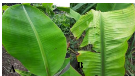
Figure 6. Pictures of banana leaves before and after being attacked by BBTV (A) leaves that were still healthy, (B), Symptoms of disease caused by BBTV