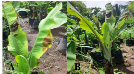
Figure 7. Pictures of banana plants affected by stunt disease (BBTV)