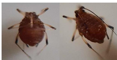
Figure 5. P. nigronervosa imago (A) imago abdomen, (B) imago dorsal

This BBTV disease attack started with the appearance of wrinkled marks on the leaves, and then the leaf color changed to yellowish and the leaf bones began to appear (Figure 7). The mean of BBTV disease attacks in the four treatments could be seen in (Table 8) where the F count was 0.54 and the F table was 3.49, means the results were not significantly different (tn) this could be influenced by several environmental factors, namely temperature, humidity, weather and the presence of natural enemies.