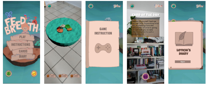
Fig. 2. FeedBreath app sections

The diary section is where teenagers can enter information about their anxiety attacks. It will allow them to keep track of their attacks and better understand the triggers that made them happen. It will also provide more information to the therapist and the parents.