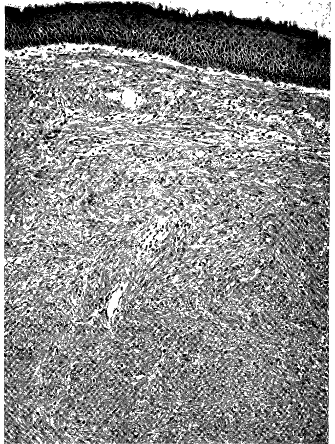
Fig. 3 Case 1. Microscopic finding showing an interlacing pattern of spindle cells with only rare mitotic figures (x 100).