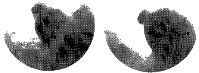
Fig. 4 Case 2. Endoscopic photograph showing a semipedunculated polypoid lesion in the middle esophagus.

Municipal Hospital for further examination. Upper gastrointestinal imaging showed an oval, well-defined filling defect in the middle esophagus. A barium meal showed a mid-esophageal filling defect with smooth edges.