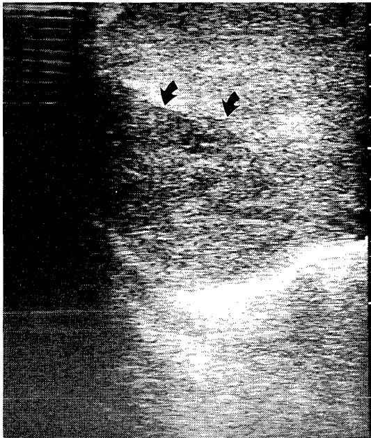
Fig. 1. US of 4 year-old boy sustained by traffic accident showing multiple lineal low density area in right lobe.

Our choice of surgical procedures for blunt hepatic trauma is shown in Table 9 . Although lobectomy or resectional debridement are advocated as an operative procedure for massive injury, a conservative management for mild or moderate ruptures is still the most highly recommendable measure and must be carried out to the extent that the patient's condition will allow.