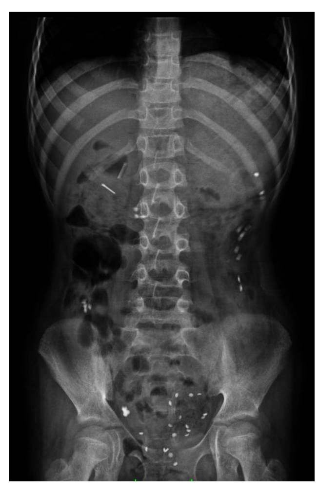
Fig. 1. Diffuse and numerous radiopaque foci in the entire abdomen with multiple air-fluid levels.

After the surgical removal of the 72 cm bezoar extending from the stomach to the upper part of the jejunum, it was a trichobezoar and was diagnosed with Rapunzel syndrome (Fig. 3) child psychiatry outpatient check-up was recommended after discharge.