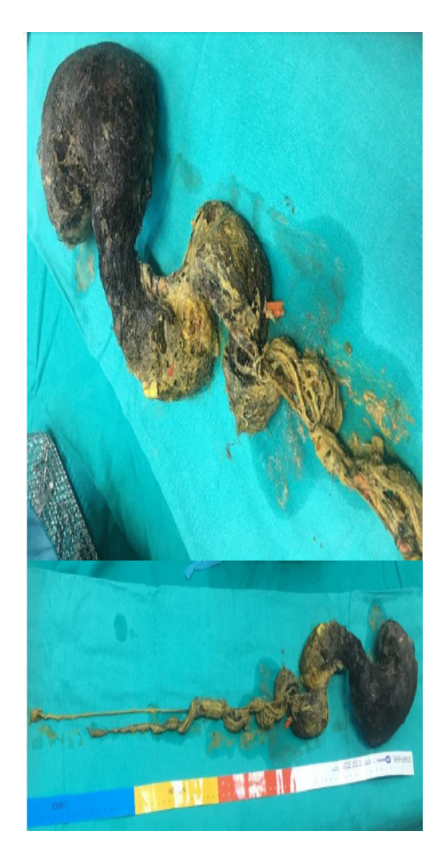
Fig. 3. Trichobezoar (72 cm) containing numerous foreign bodies (beads, nails, pins and plastic parts)