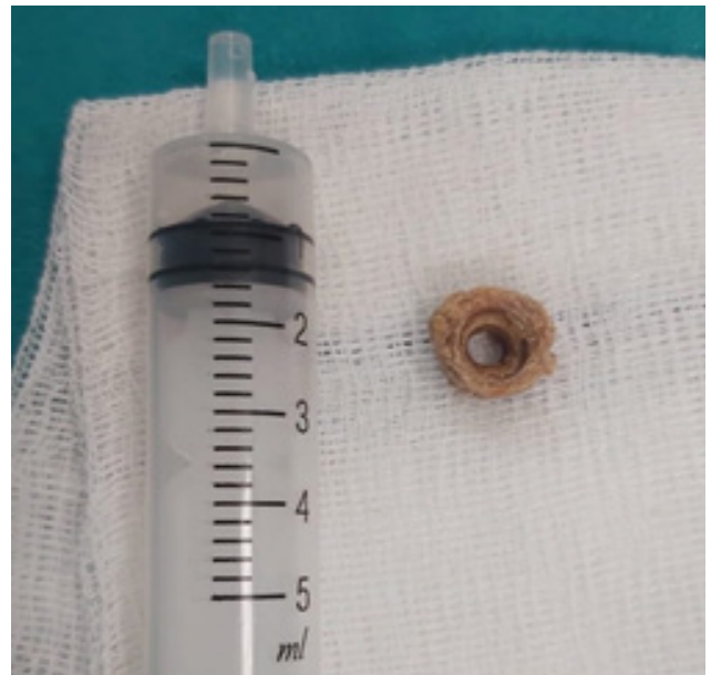
Figure 3: Deformed image of the foreign body removed by bronchoscopy.