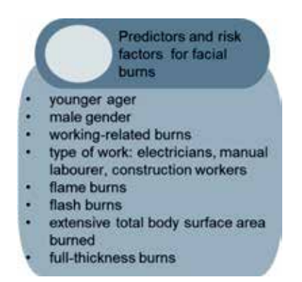
FIGURE 1. Frequent predictors of facial burns

Amin et al. reported an increased incidence of firearm injuries to the head and neck during the COVID-19 pandemic, associated with alcohol consumption [13]. Another study, targeting head and neck burns during pandemic, showed that even though there was an increase in the number of cases in the first March of the pandemic, overall prevalence was the same as the pre-pandemic period [16].